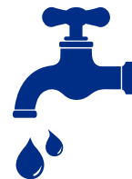
Well Water Storage