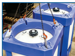
Optional Top Lifting Lugs Available